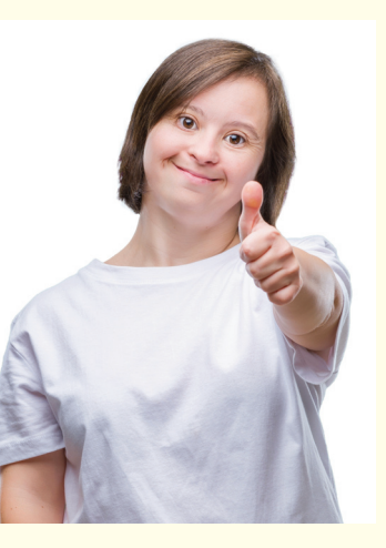
Human Rights Act 1998