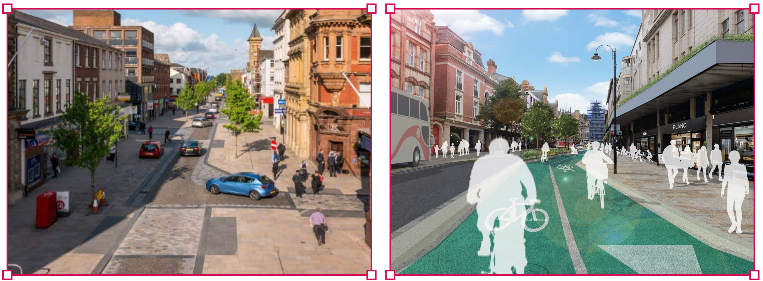
Fishergate, Preston - Pedestrian priority