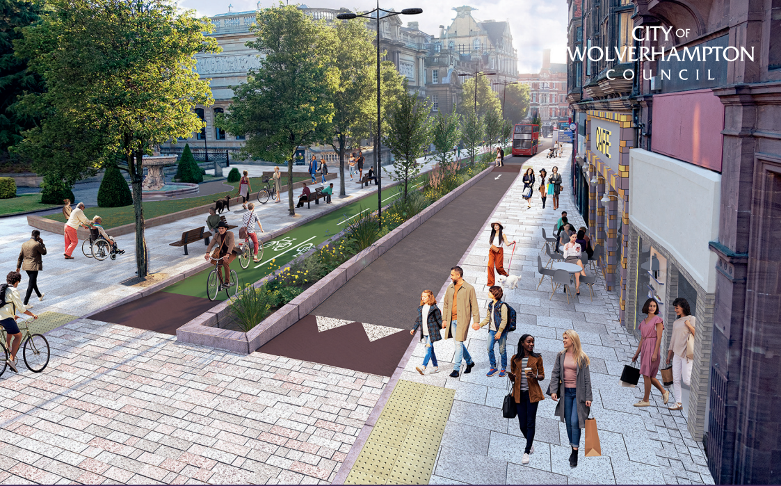
Artist's impression of Lichfield Street