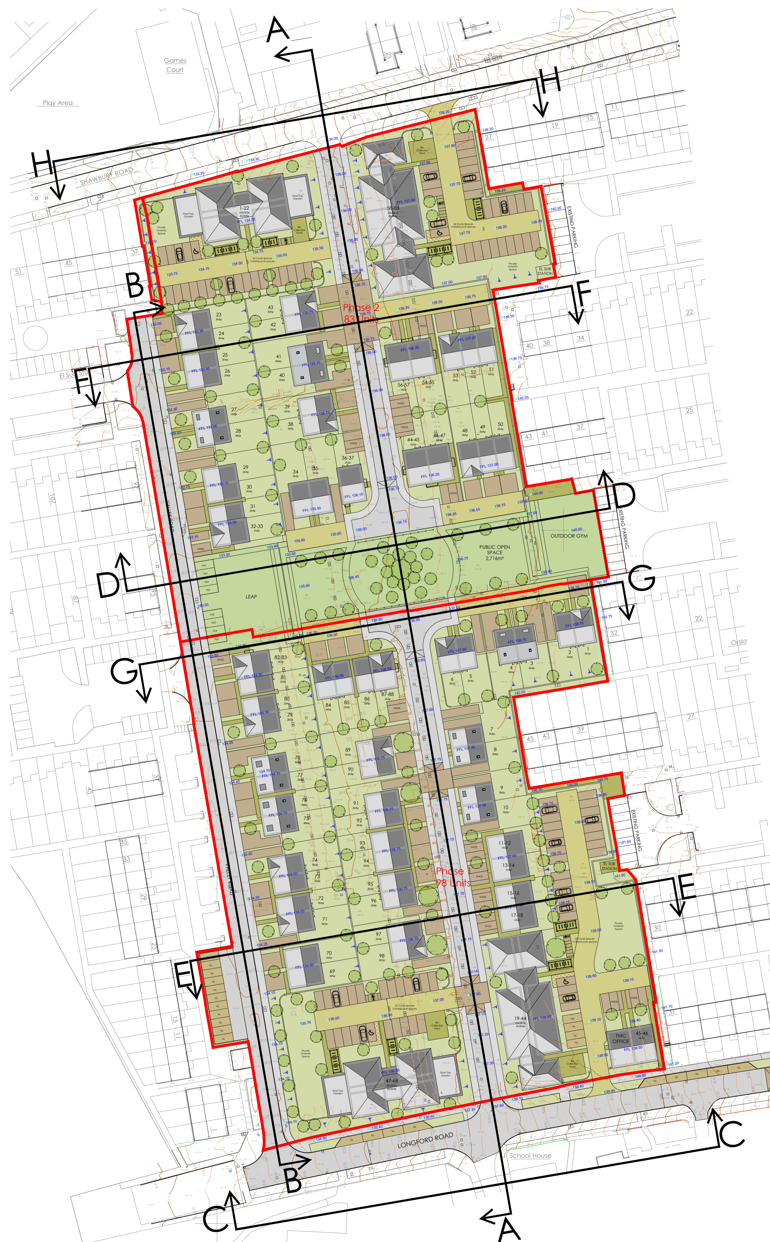
Street Scene Key