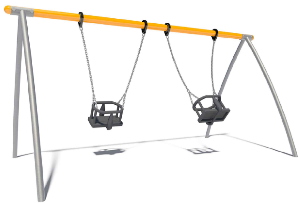
HAGS SMP 1.8m Olympic 2 seat swing with cradle seats