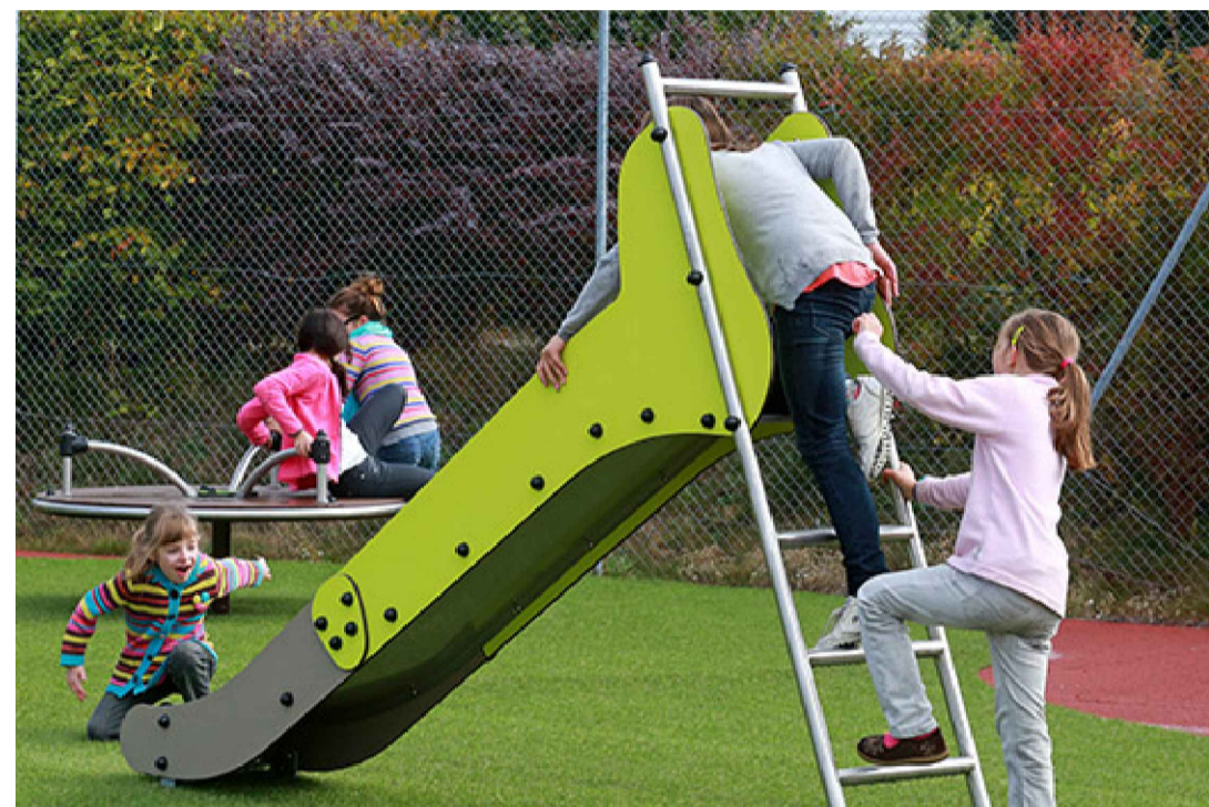
Proludic J1010 Slide