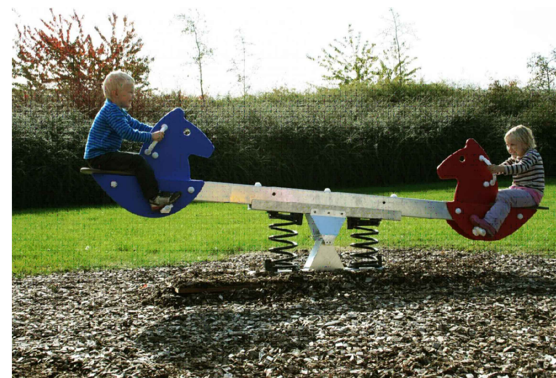
Kompan M182 Horse Seesaw