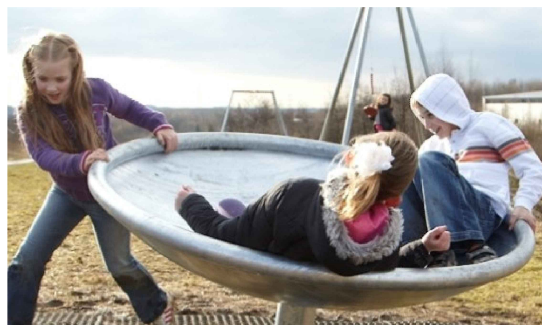
Sutcliffe 1.5m Large Dish Roundabout