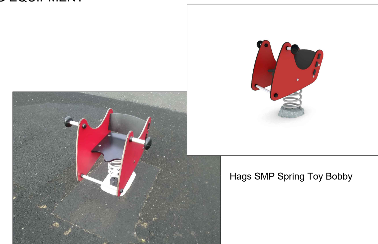
Hags SMP Spring Toy Bobby